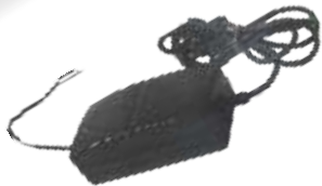
SMPS 24V / 2.5AMP.