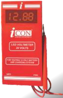
0-20V DC VOLT METER