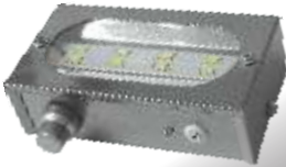
4V LED LIGHT