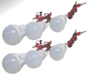
D.C. LED BULBS