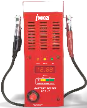
BCT - 7